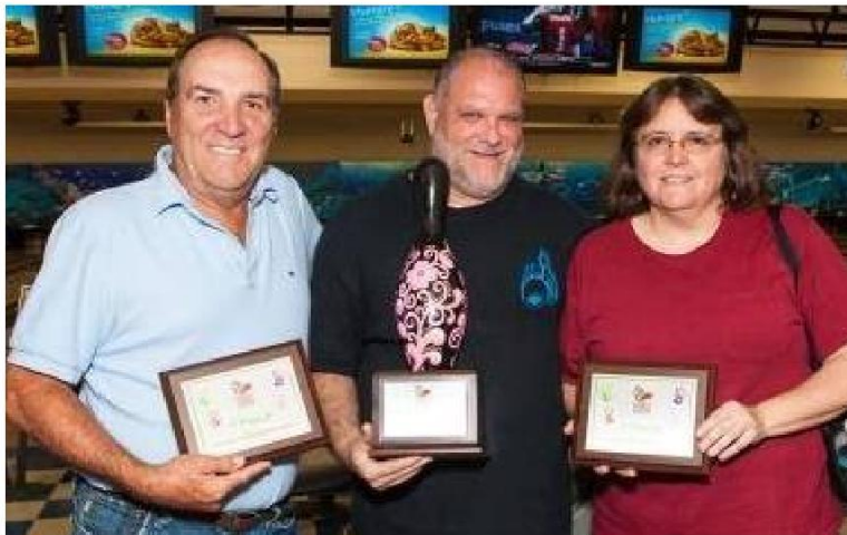
Sabadell United Bank - 1st Place Tournament Winner

On Saturday, June 7, supporters gathered at Bird Bowl in Miami to raise funds for Family Resource Center's programs for children who have suffered child abuse and neglect. More than 300 people attended this year's Strike Against Child Abuse Charity Bowling Tournament, generating just under $30,000.