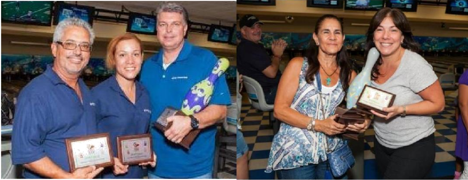
City National Bank, 2nd Place Winner