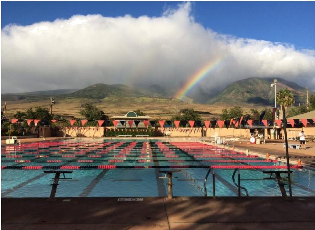
before swim practice in Maui, HI.